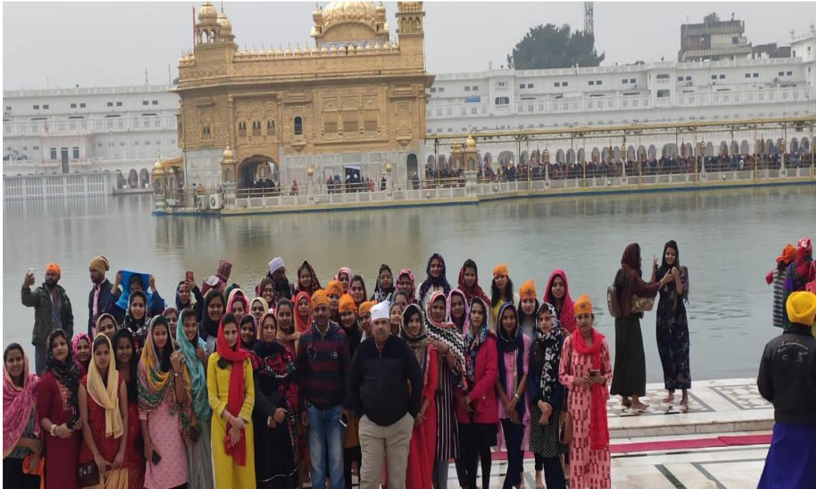
Visit to Golden Temple at Amritsar.