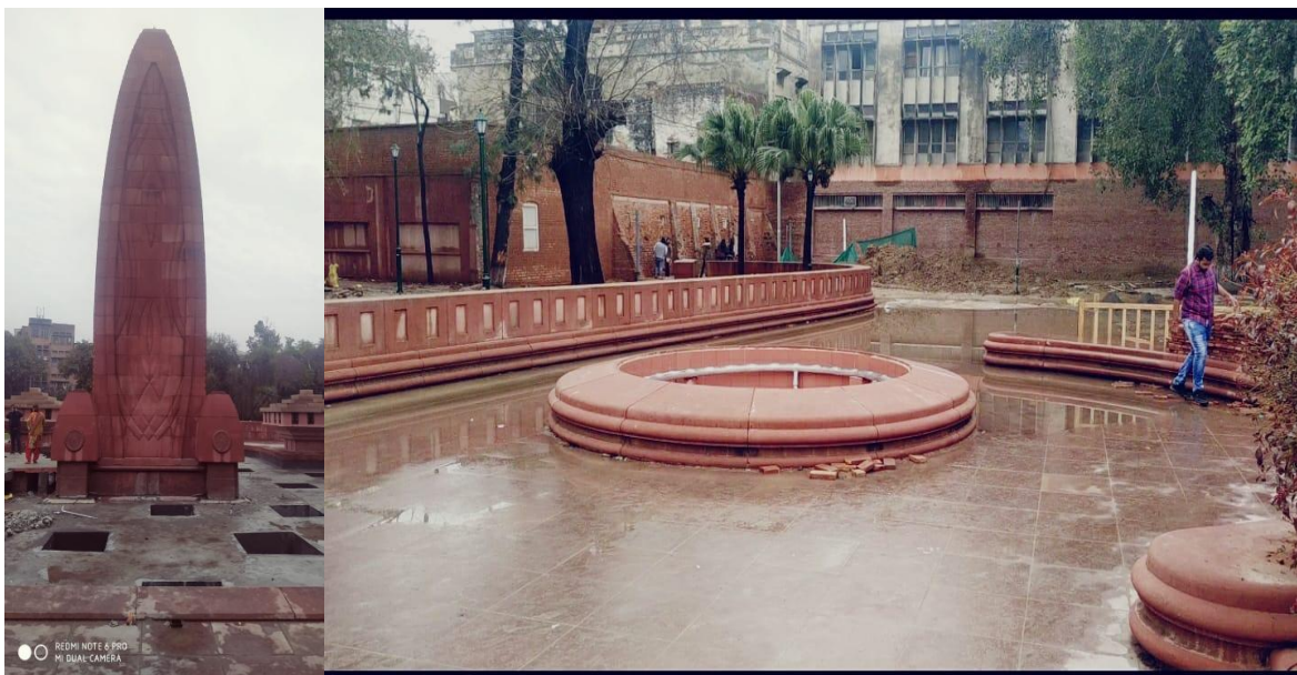
Visit to Jallianwala Bagh at Amritsar

In the afternoon, we visited to Jallianwala Bagh at Amritsar . Jallianwala Bagh is a historic garden and ‘memorial of national importance’ in Amritsar , India, preserved in the memory of those wounded and killed in the Jallianwala Bagh Massacre that occurred on the site on the festival of Vaisakhi, 13 April 1919. In 1919, in response to excluding Mahatma Gandhi from visiting Punjab, the secret deportation of Saifuddin Kitchlew and Satyapal on